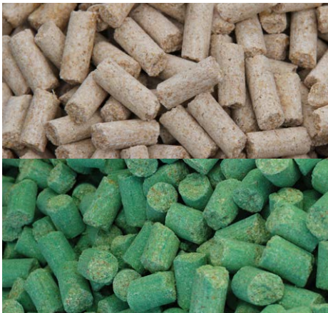
Pre-feed pellets (top) and toxic baits (bottom).

The vast majority of possum control in the region is done by local contractors using ground-based traps and hand-laid toxins. The remaining area is controlled using aerially applied pellets containing biodegradable 1080.