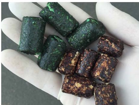
Baits covered in deer repellent. The non-toxic pre-feed pellets are brownish-tan while the toxic baits are green.

Advanced GPS navigational equipment will be used to ensure the pellets are accurately placed and exclusion zones avoided.