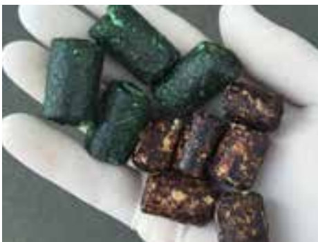
Baits covered in deer repellent. The non-toxic pre-feed pellets are brownish-tan while the toxic baits are green.

A vast majority of possum control in the region is done by local contractors using ground-based traps and hand-laid toxins. The remaining area is controlled using aerially applied pellets containing biodegradable 1080. Aerial control is highly-efficient, cost-effective and has historically been extremely successful at knocking possum numbers down to very low levels. It is preferred in areas like Southern Rimutaka due to the rugged nature of the terrain. The Parliamentary Commissioner for the Environment also supports aerial