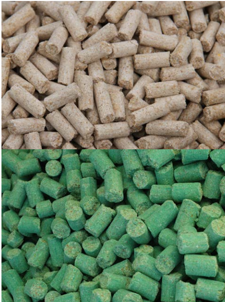
Top: Non-toxic pre-feed pellets; bottom: Toxic 1080 baits.

The operation will have additional conservation benefits for native birds and bush. Possums eat the forest canopy and prey on native birdlife, including eggs and chicks. Biodegradable 1080 is also extremely effective at controlling other introduced predators such as ship rats and stoats.