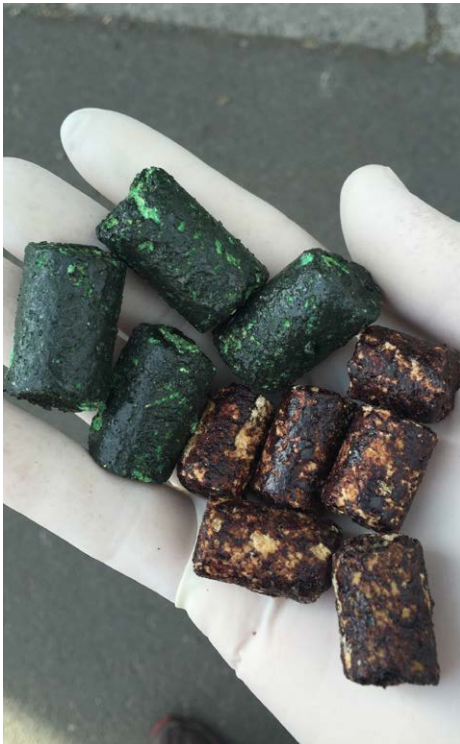
Baits covered in deer repellent. The non-toxic pre-feed pellets are brownish-tan while the toxic baits are green.

The Kaipo operation will be subject to strict safety, quality-assurance and monitoring requirements. Advanced GPS navigational equipment will be used to ensure the pellets are accurately placed and identified exclusion zones are avoided.