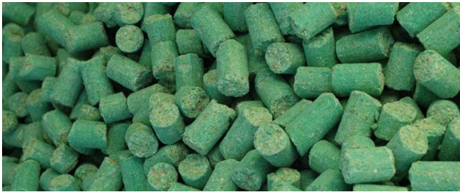
Pre-feed pellets (top) and toxic baits (bottom)