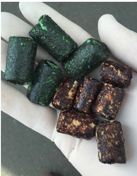
Baits covered in deer repellent. The non-toxic pre-feed pellets are brownish-tan while the toxic baits are green.

sodium fluoroacetate (also known as 1080) – will be applied by helicopter at a rate of two kilograms per hectare. That's about one bait to every 60 square metres. Bait coated in deer repellent may be used in the area shaded in green. This area, as well as water exclusion zones, will be finalised after further consultation.