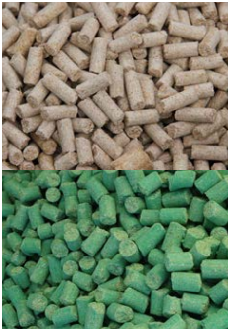
Top: Non-toxic pre-feed pellets. Bottom: Toxic 1080 baits.