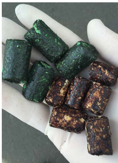
Baits covered in deer repellent. The non-toxic pre-feed pellets are brownish-tan while the toxic baits are green.

Please visit pce.parliament.nz to read this report.